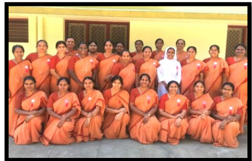
- Silver Brides (Batch 2020)

Gratitude makes sense of our past, Brings peace for today, And creates a vision for tomorrow It's a powerful catalyst for happiness. It's the spark that lights a fire of joy in your soul