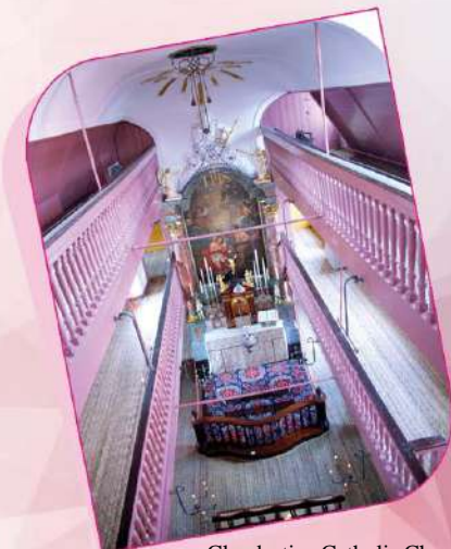
Clandestine Catholic Church, AMSTERDAM

In addition to the prevailing prohibition, the consequences of the French Revolution also impacted the practice of Catholic faith in public. The Catholics were subjected to petty supervisions, and very severe anti-Catholic laws were passed concerning schools and education in general.